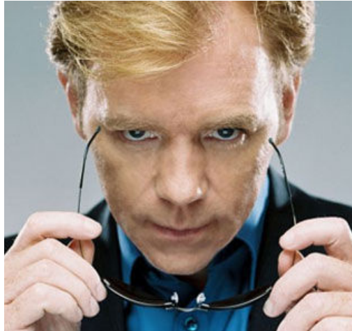
Looks like he'll be getting his 'pork'... In the prison showers! YEEEEEEEEEEEEAAAAH!!!!